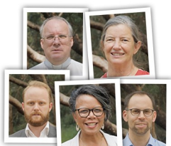
Diocese of Parramatta Laudato Si' Action Team